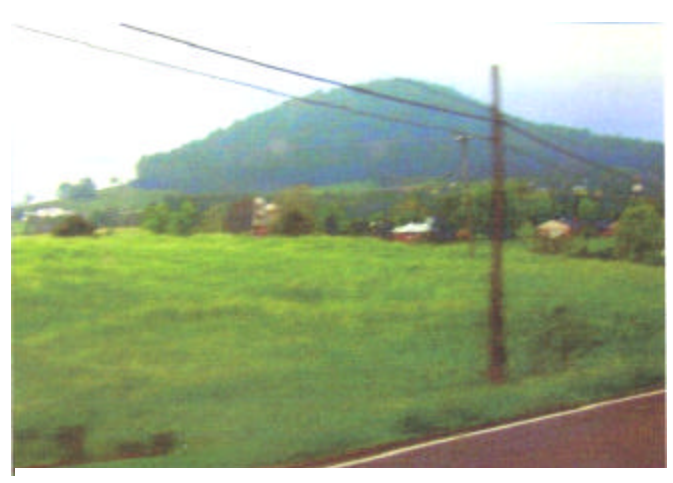
Jane's Quest: Mole Hill, an actual volcano remnant.

An article by Jane Owen, reprinted from Sept. 2008 issue of The Collecting Bag