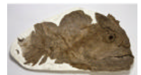
Bulldog fish fossil

Closed for break: Dec. 16, 2009-Jan 4, 2010 March 6-15, 2010 April 2-5, 2010