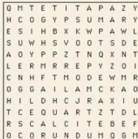
Mohs' hardness scale and the three main rock types