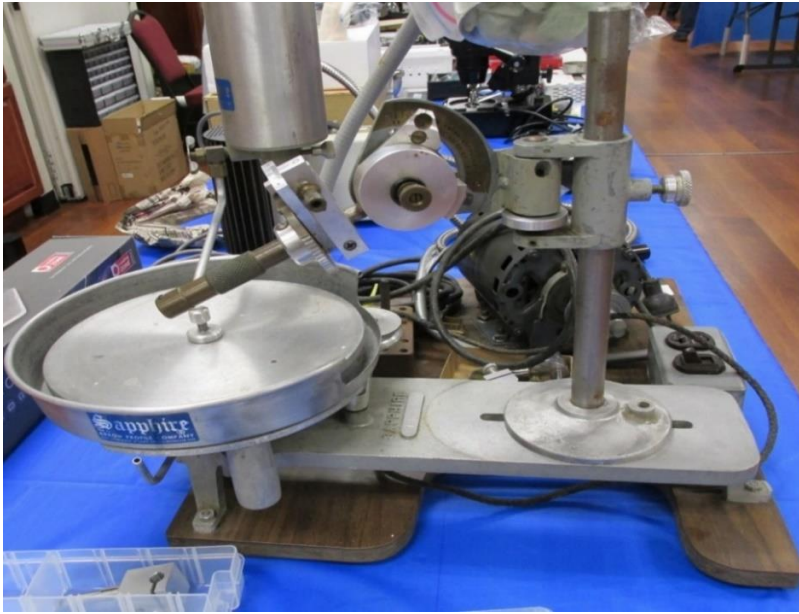
43. "Sapphire". A Mast Type Faceting Machine from Australia.