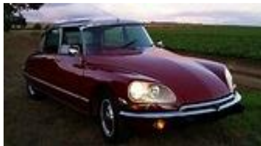
1971 DS 21

With two flats, this front-wheel drive car can be safely driven on three wheels. The only addition in 20 years was self-leveling, tuning lights, pivoting with the steering up to 90 digress in anticipation of a turn.