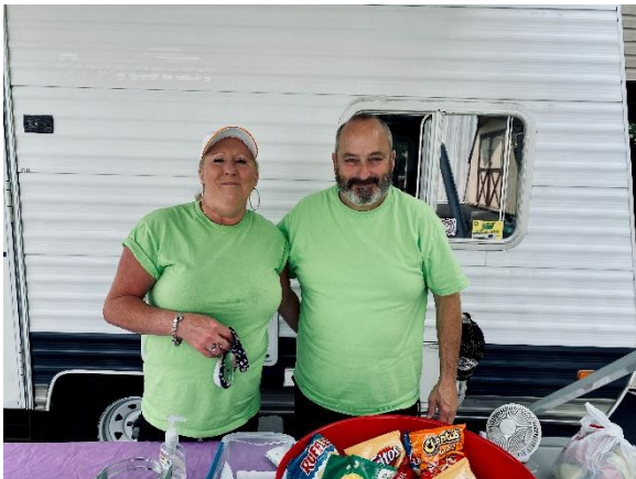
Hot Diggy Dog Food Truck