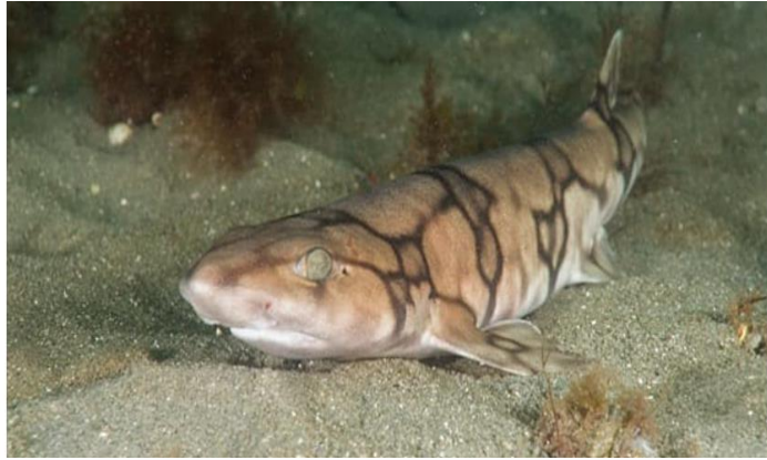
This picture shows a chain cat shark

See https://sbc.edu/stem/john-morrissey/