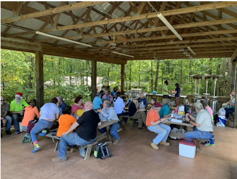
After the dig people enjoying each other's company

A great Thank You to those at Willis Mountain that allows us to go there and collect and enjoy those that like rocks like we do. It was a tremendous day of collecting and everyone stayed safe and there was no safety events.