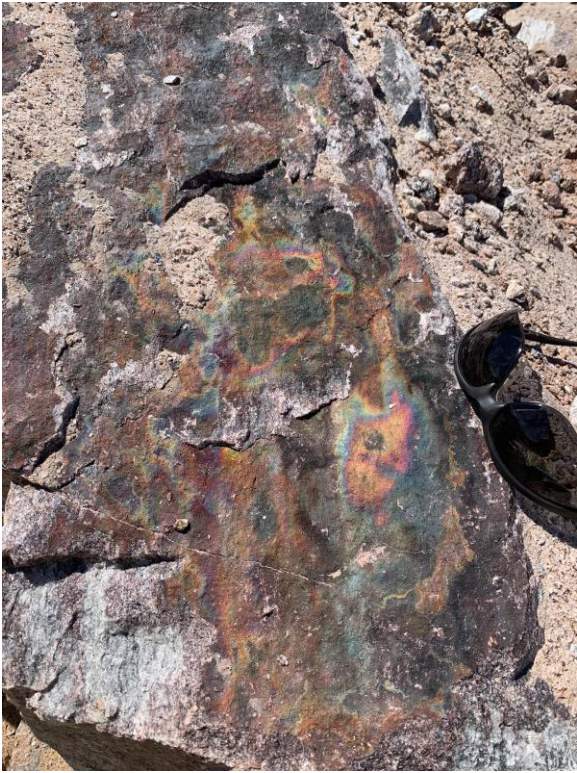
A large rock with Rainbow colors