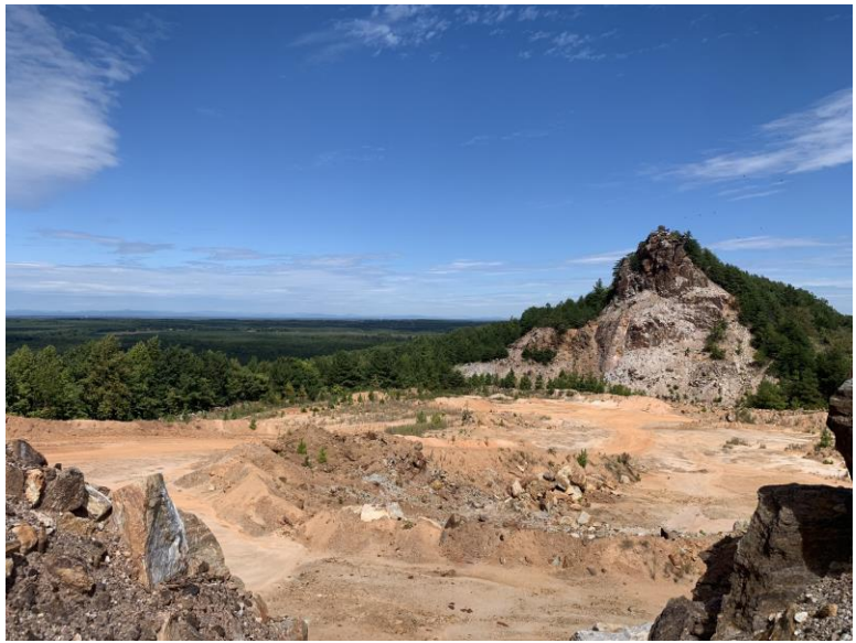
A shot from the top of the mountain