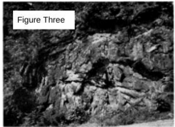
1A. Part of Lynchburg anticline in Lynchburg formation on northeast side of James River opposite Lynchburg.