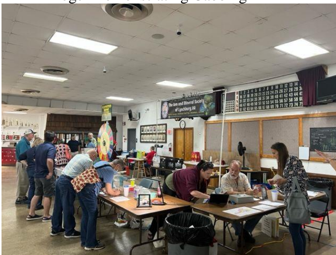
Front desk workers and Picker's wheel