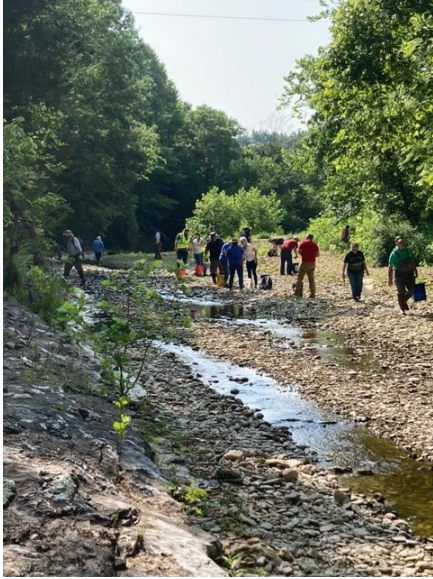
Geodes in the creek