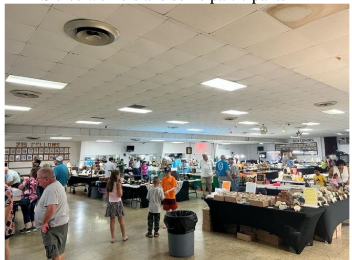
A show of the sales floor