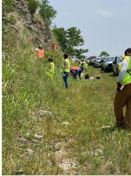
Fossils on the roadside