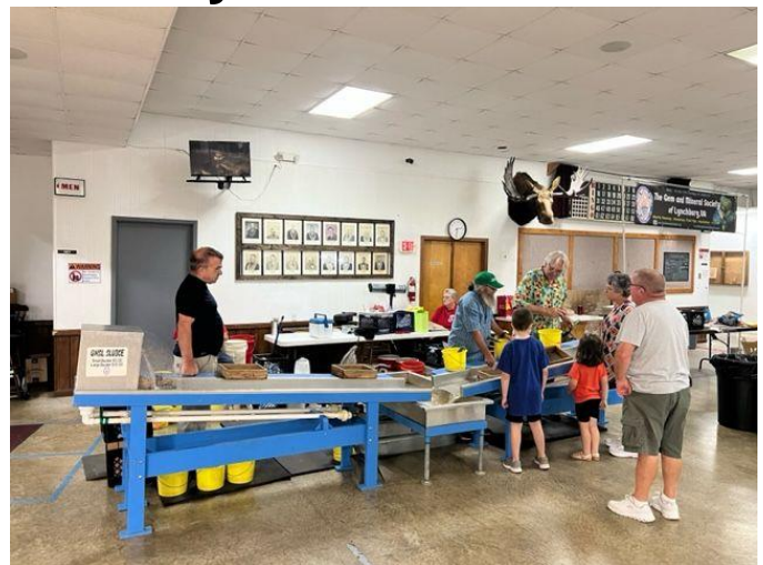
Sluice workers and some participants