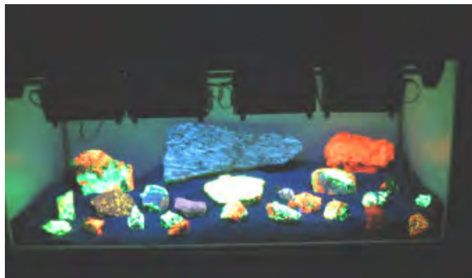
at the Roanoke Gem and Mineral Society Annual Show.

We wish you both a full and speedy recovery!