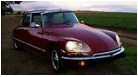
1971 DS 21

With two flats, this front-wheel drive car can be safely driven on three wheels. The only addition in 20 years was self-leveling, tuning lights, pivoting with the steering up to 90 digress in anticipation of a turn.