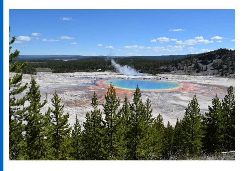
This is a picture of the same pool just from up on the side of a mountain.

This is a picture of the prismatic pool at Yellowstone. I thought that the colors were great and the brown lines looked like cracks.