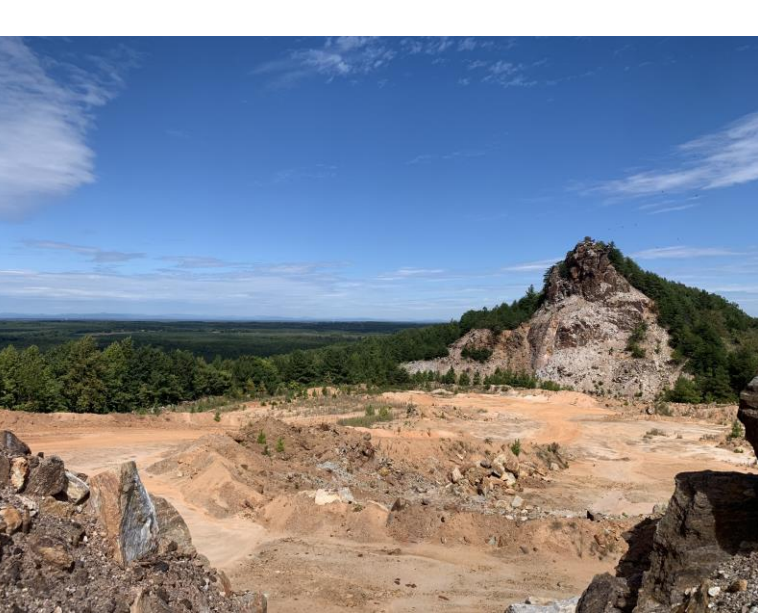
A shot from the top of the mountain