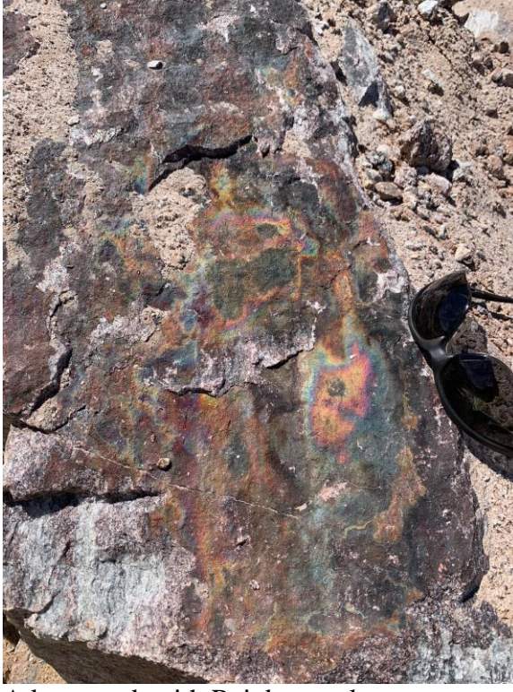
A large rock with Rainbow colors