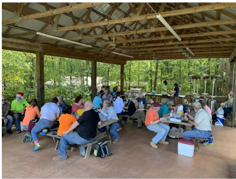
After the dig people enjoying each other's company

A great Thank You to those at Willis Mountain that allows us to go there and collect and enjoy those that like rocks like we do. It was a tremendous day of collecting and everyone stayed safe and there was no safety events.