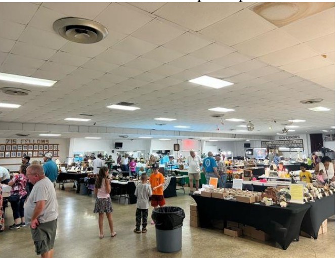
A show of the sales floor