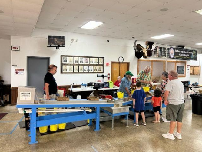
Sluice workers and some participants