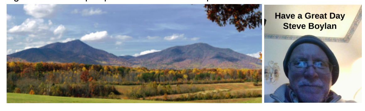
Figure Two - Sharp Top Mountain and Flat Top Mountain

The letters PZmy, Ypg and Yc on the map designate rock formations. PZmy is a formation of mylonite gneiss. Ypg is a formation of layered gneiss and granulite. Yc is a formation of charnockite. So as you walk up the trail to the summit of Sharp Top Mountain, you are walking on mylonite gneiss, then gneiss and granulite and finally charnockite at the top. Figure Two shows pictures of Sharp Top Mountain and Flat Top Mountain from the internet. You can see a lot of things from the internet.