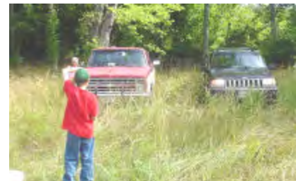
Our hosts extended a warm welcome and invitation for a return trip in the future.