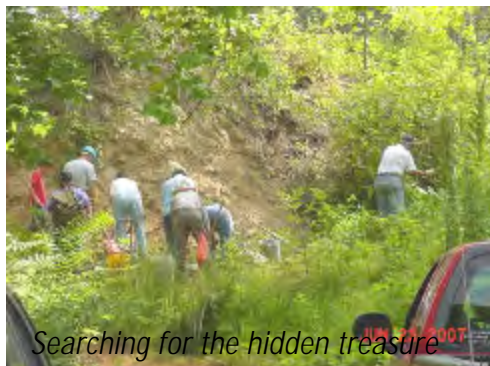
Searching for the hidden treasure

I believe that everyone had great time and were able to find some pretty yard rocks and good representative examples of rutile, Ilmenite, blue quartz and feldspar in spite of the acres of kudzu that had almost covered the site. This is a winter or early spring trip for sure and we will try to schedule another trip perhaps in the spring.