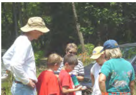
Club members sharing stories and specimens with the young mine owners.