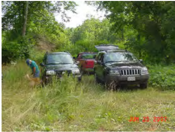
Left: the owners dogs gave the field trip attendees and their dogs a quick once over, and everyone paired off and made new friends. (Dogs included)