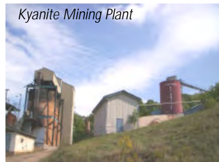
Kyanite Mining Plant

Continued on page 13, with additional photos on page 16