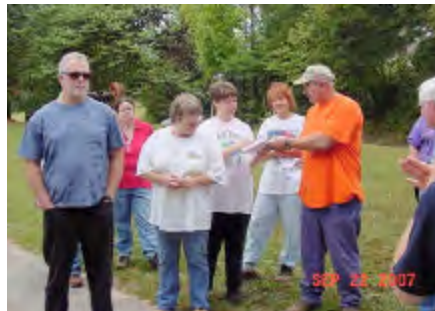
SEP 22, 2007