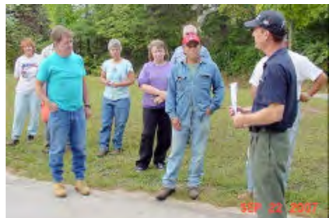
SEP 22, 2007