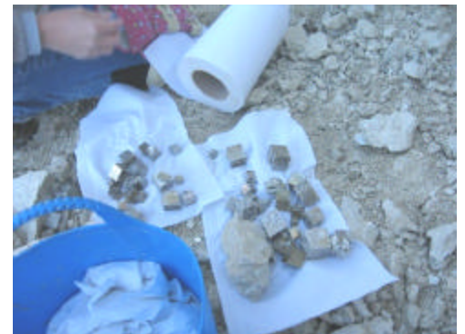
Due to it's fragile nature, all of the pyrite cubes had to be wrapped to protect the specimens from breakage or other damage.

Finally to the collecting! Please take a look at the pictures included in this article. I wish I could show you all the pictures that we took at Navajun. Collecting was amazing! Also, it was so very easy. The hard part was we had to stop and wrap up the specimens. I just wanted to break away more chunks of matrix and expose more cubes. You could literally just pull the cubes out of their positions in the wall. When breaking off a new section of matrix, you had to be careful because cubes would fall down as you pull the matrix section from the wall. The matrix material is mostly a very fine-grained sedimentary marlstone (clay and calcite). The matrix was sort of damp, which made it easier to chisel sections off the wall. Since we were paying a hefty fee for digging, our task was to pack-up the best specimens. However, I didn't want to pass anything up. Remarkably, some of the cube might have a place where it was touching another cube on the corner resulting in a broken corner. Those just went over your shoulder. I would estimate for every one cube that we kept, we put aside ten. The specimen quality ranged from perfect, shiny cubes to those of a duller shine. Some of the cube appeared to be somewhat compressed.