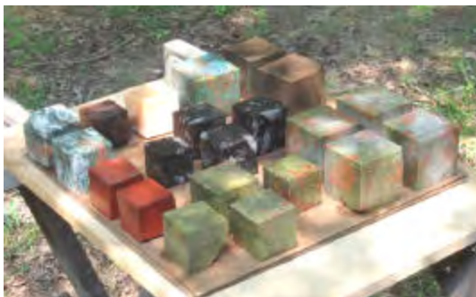
"Sphere Blanks" have been cut from larger rocks in preparation for the sphere machines.

There is something for everyone to do, and if you want to learn something new this is a great opportunity as there will be many "old hands" on site.