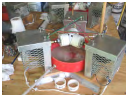
Once precutting is complete, "blanks" go through a series of machines using different grit.