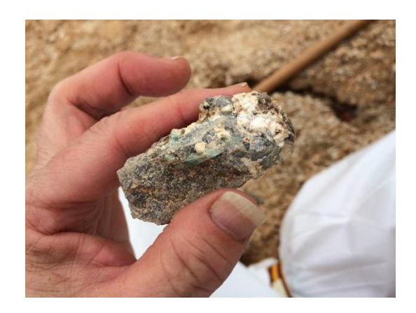
Examples of beryl found at Amos Cunningham's farm.